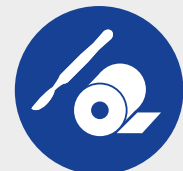
HEALTHCARE MEDICAL AIDS

Compas specializes in batch production (food & beverage, pharmaceuticals, chemistry, medical aids). Our customers include leading domestic names and international groups with production plants in the Czech Republic and the EU. The company's business department has a list of selected references for your industry and further information.